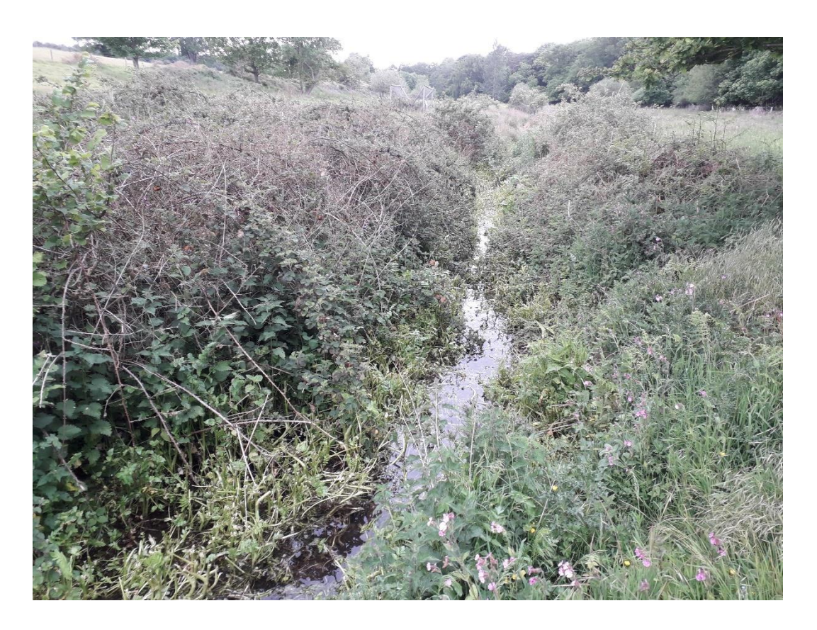
Figure B-3 – Foxburrow Stream aquatic macroinvertebrate sampling location.