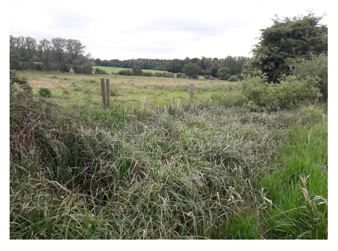
Figure B-4 – Hall Ditch aquatic macroinvertebrate sampling location.