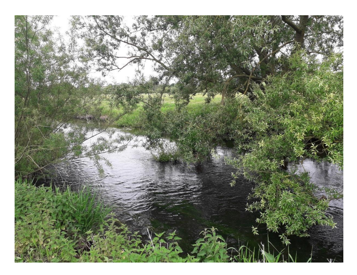
Figure B-1 - River Wensum Upstream aquatic macroinvertebrate sampling location.