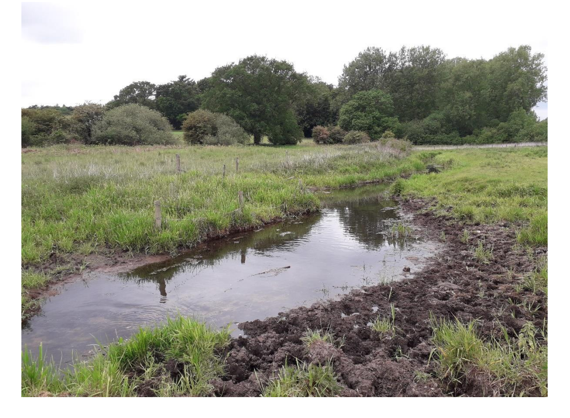
Figure B-5 – Ringland Ditch aquatic macroinvertebrate sampling location.