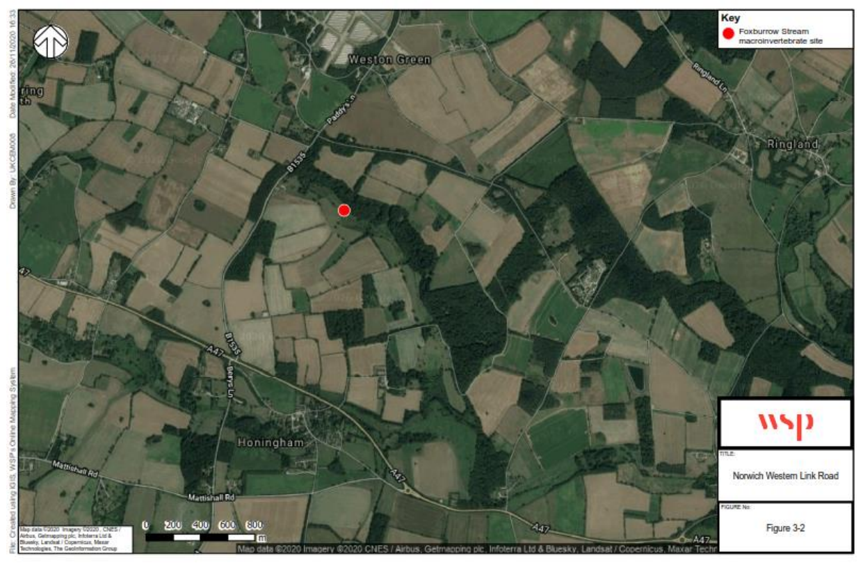
Figure 3-2 – Macroinvertebrate sampling site on Foxburrow Stream.