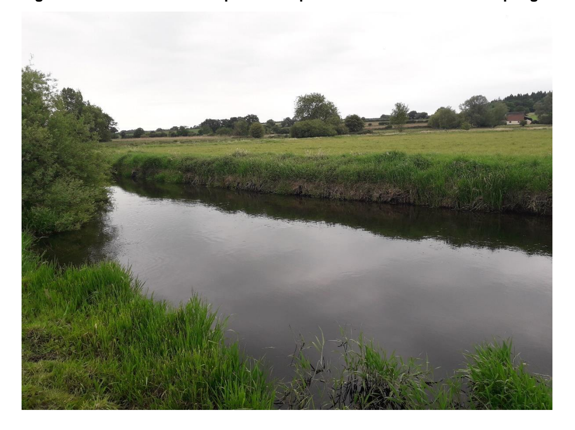
Figure B-2 - River Wensum Downstream aquatic macroinvertebrate sampling location.